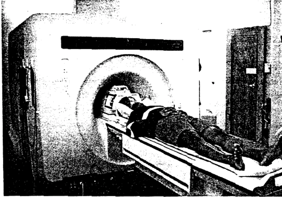
Figure 16.1. A 1.5-T, 100-cm-diameter bore NMR system for human clinical use. The table automatically moves the subject into the magnet.